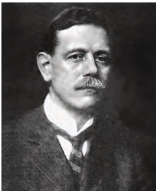
Irving Pond of Pond & Pond

The architects, all noted for their fine work, made great effort to continue the Arts and Crafts style of the early 1900s. In the end, a sweeping vista can be seen when viewed from the front of the building. The interior layout of the building, such as the multiple floor levels, present challenges, especially in regard to accessibility. If we want to keep the school, some changes like this are needed.