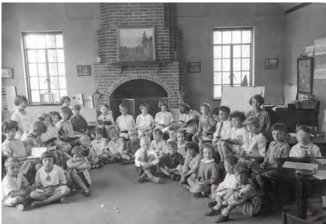
A 1920s Ravinia School classroom by Pond and Pond, who thought school rooms should be made comfortable by including fireplaces like the living rooms in most houses had at that time.