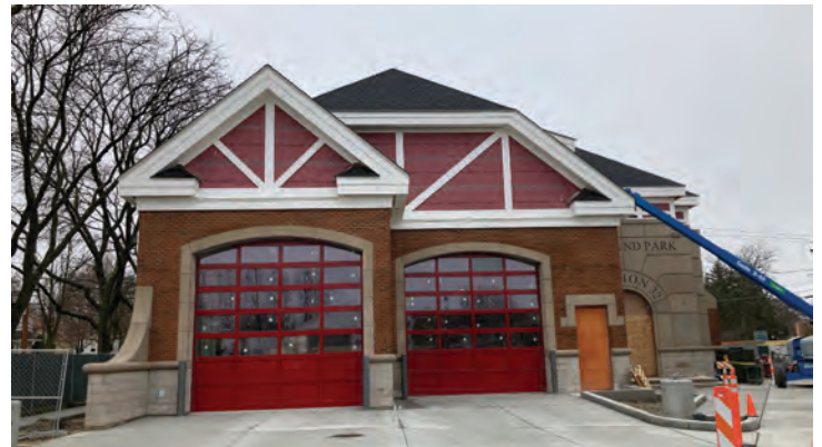
14-foot-wide doors assure quick, safe movement in and out for apparatus.