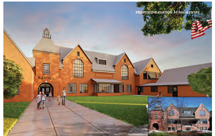
Proposed front elevation and existing front facade (inset). The front door will be moved to the tower entrance. The existing front door and the double main entrance stairs are going away to be replaced by a conference room.