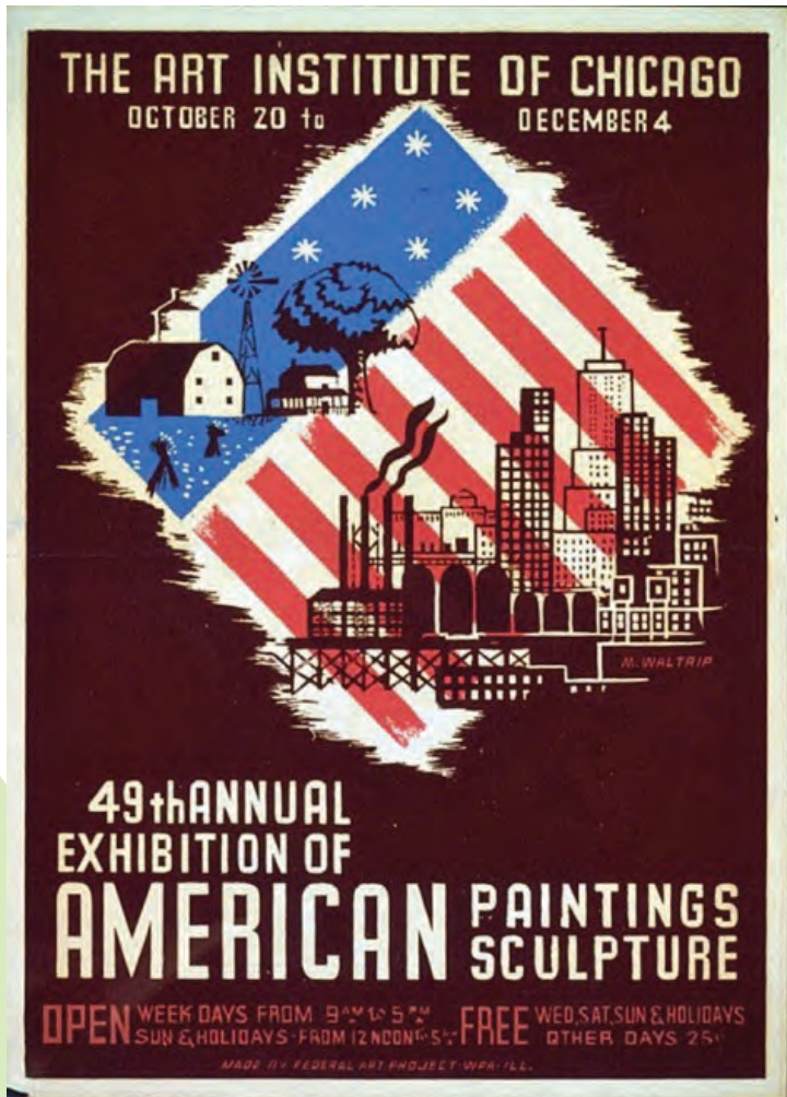
Mildred's poster for the Art Institute of Chicago's 49th Annual Exhibition of American Paintings and Sculpture, 1937, silkscreen.

Following is the "Living New Deal Project" description of Ravinia School's murals: The pair of murals in Ravinia School main entrance, painted in oil on canvas, entitled "Robin Hood," was completed in 1940 under the WPA Federal Art Project (WPA-FAP) program.