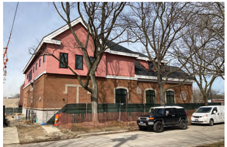
Second floor includes kitchen, locker, laundry and individual bunk rooms.