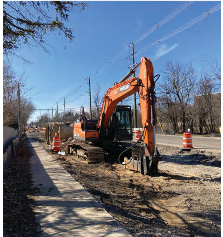
Separate bike and pedestrian path south of roadway replace former sidewalk.

With the shared use path now separated from the roadway, cyclists will no longer need to be concerned about making a false move that could send them into the path of a car or truck, and it should give drivers a similar sense of security. The existing roadway alignment will