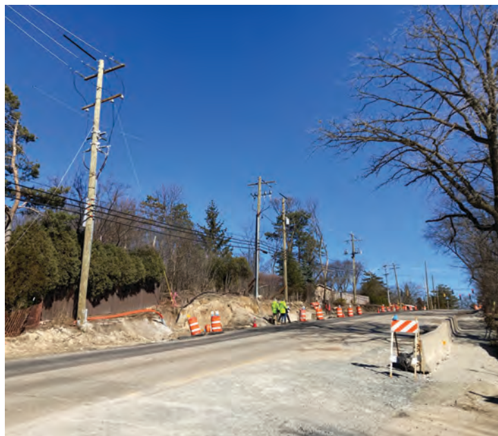
Two lanes separate vehicles heading different directions at Green Bay

remain the same, with only slight deviations in limited areas, such as approaches to the new bridge across the Skokie River and a couple of left turn lanes allowing eastbound drivers safer access to side streets, Fink Park and a synagogue.